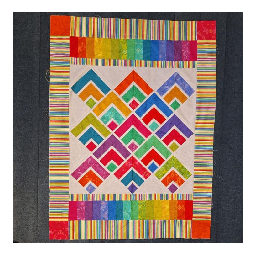
Approx. finished size: 36" by 48" By Valerie Nesbitt